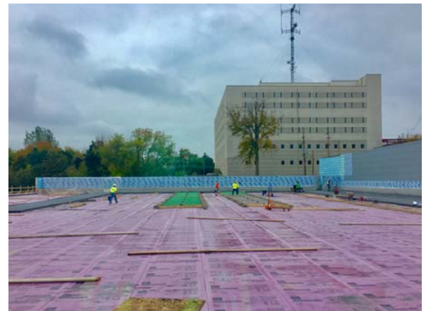
Martell has begun pouring the plaza deck.