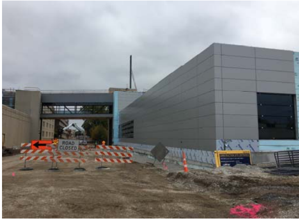
Road work continues on Lawrence Street. Metal panel work is complete.