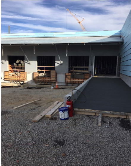
Work continues at the loading dock; the access ramp is poured and sub-grade is being prepped for concrete.