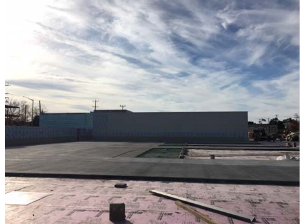
Work continues on the plaza level concrete.