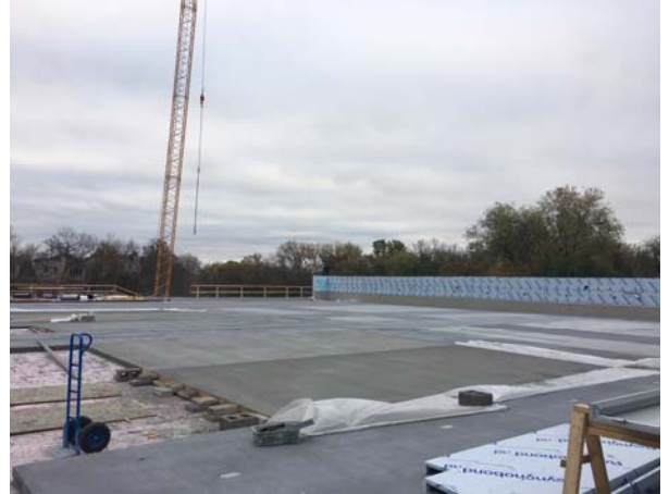
Work continues on the plaza deck concrete.