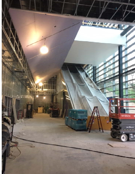
Drywall is being installed on the soffits in the pre-function area.