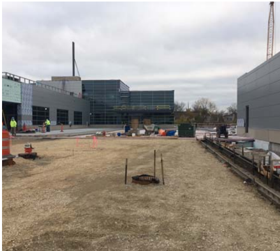
Site work continues at street level in front of the plaza deck. Stone base and utilities are in place, and crews are beginning to form curbs.