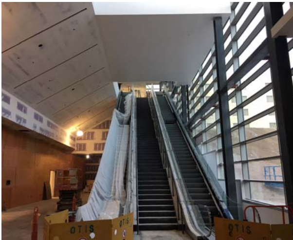
Glass handrail and other finishes are being installed on the escalators.