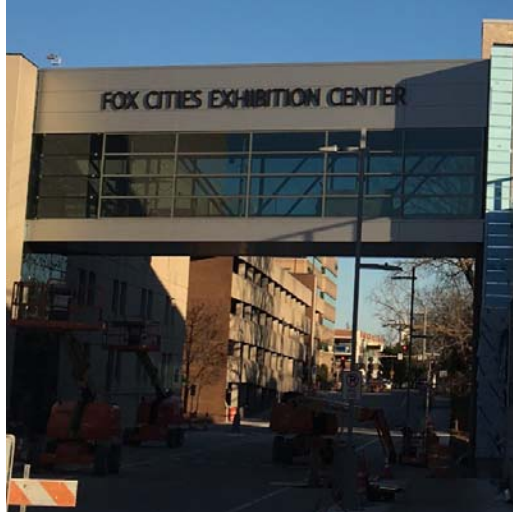
Fox Cities Exhibition Center signage has been installed on the crosswalk.