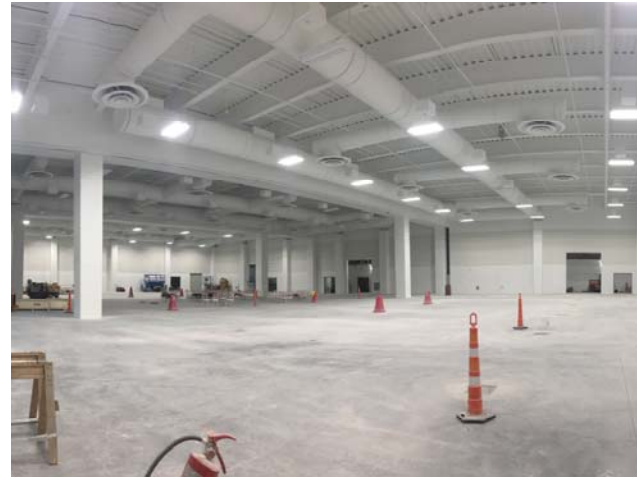
The exhibition hall has been painted and the acoustical wall panels were installed.